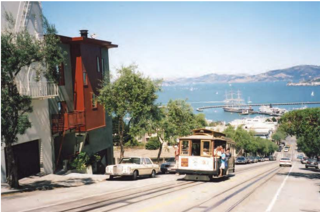
Photograph C for Question 3 is on page 4